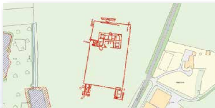
Minster Roman villa and associated buildings plotted in the HER GIS mapping

Six separate buildings were identified along with a vast array of finds. The buildings included a bathhouse, a possible corn dryer, large sections of the boundary walls, and various ancillary structures. It seems likely that other structures remain to be discovered. The main villa building, revealed over several seasons, consisted of a 'winged-corridor' house of a well-known Romano-British type. A large quantity of finds were gathered and analysed, including pottery, tile, glass, animal bone, painted plaster, mosaic fragments, coins, and other artefacts. The excavated evidence suggests that the villa was established towards the end of the 1st century AD and continued into the early 3rd century being abandoned by the late 3rd century. Overall, the results gathered by the volunteer archaeologists at this site significantly enhances our understanding of the Roman period in Thanet and contributes to villa studies at a regional level.