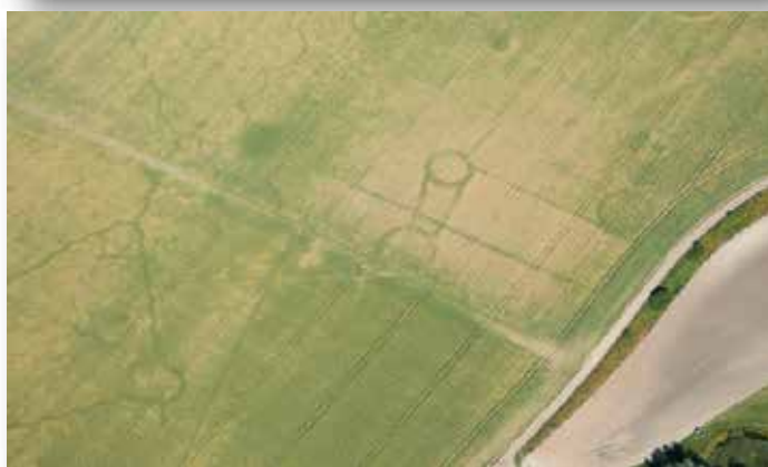
Top: AIM work in remaining open areas between Acol, Brooksend Farm and Birchington