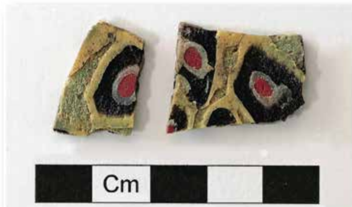
Polychrome mosaic glass discovered during excavations at Minster Roman villa

Six separate buildings were identified along with a vast array of finds. The buildings included a bathhouse, a possible corn dryer, large sections of the boundary walls, and various ancillary structures. It seems likely that other structures remain to be discovered. The main villa building, revealed over several seasons, consisted of a 'winged-corridor' house of a well-known Romano-British type. A large quantity of finds were gathered and analysed, including pottery, tile, glass, animal bone, painted plaster, mosaic fragments, coins, and other artefacts. The excavated evidence suggests that the villa was established towards the end of the 1st century AD and continued into the early 3rd century being abandoned by the late 3rd century. Overall, the results gathered by the volunteer archaeologists at this site significantly enhances our understanding of the Roman period in Thanet and contributes to villa studies at a regional level.