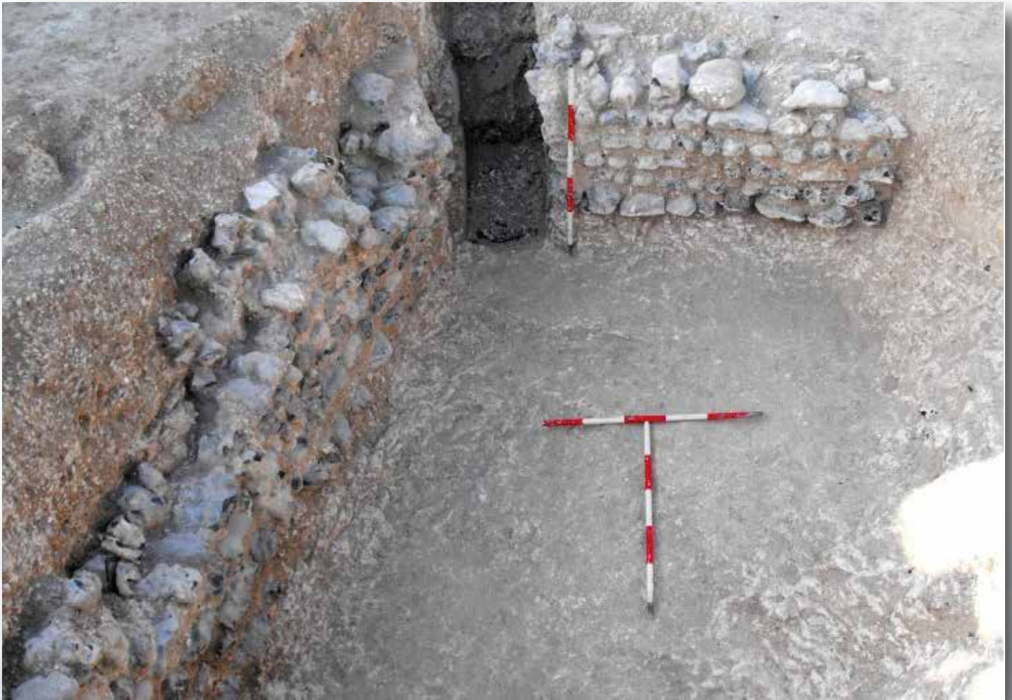
Roman cellar at Bleak House in Broadstairs excavated by The Trust for Thanet Archaeology

Roman buildings were also identified on land adjacent to Bleak House in Broadstairs during excavations in 2007 and 2009. Three buildings were uncovered, and although the superstructure was lost, the remains suggest buildings of considerable size and sophistication. They bore similarities to those discovered off Stone Street, and the assemblage of pottery was also comparable. As with the Bronze Age evidence discussed earlier, these small-scale investigations provide evidence for what is happening in a wider landscape. They offer clues to the purpose and character of Roman settlement in this part of the district and point to the strategic significance of the east coast of Thanet and the North Foreland peninsula in the later Roman period.