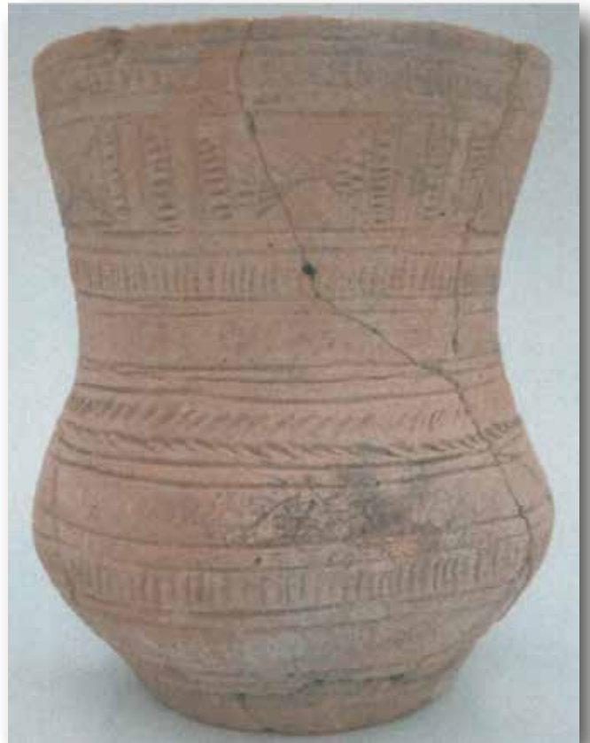
The Beaker discovered alongside the burial at North Foreland Avenue

The information gathered from this small-scale investigation contributes to our understanding of the distribution of prehistoric activity and burials in the area, especially when considered alongside other nearby excavations. These include the investigation at Fairacre Lodge, less than 50 m to the west, which also produced evidence of a Bronze Age barrow and inhumation, and the excavations at St Stephen's College off North Foreland Road, less than 200 m to the south, which provided evidence of Bronze Age activity in the form of ring ditches, though these are likely slightly later in date.