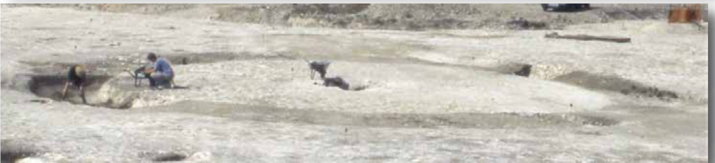
Two of the ring ditches excavated by the Trust for Thanet Archaeology at St Stephen's College